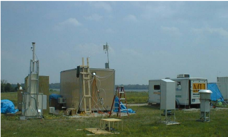
Harvard SPH and Philadelphia AMS Lab measure particle properties